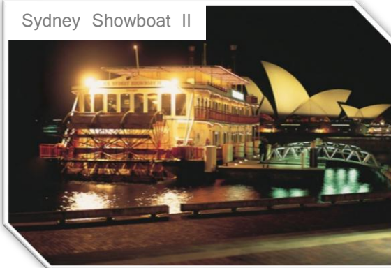
Sydney Showboat II